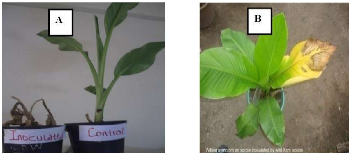
Figure 2. (A left) Death of enset plant ('Astara' clone) after inoculation with an Xcm isolate collected from cultivated enset and (A right) healthy looking control plant of same clone; (B) wilting of the enset clone 'Sorpie' after inoculation with an Xcm isolate obtained from wild enset.

induce any symptom and hence the isolates were considered non-pathogenic to enset and banana.